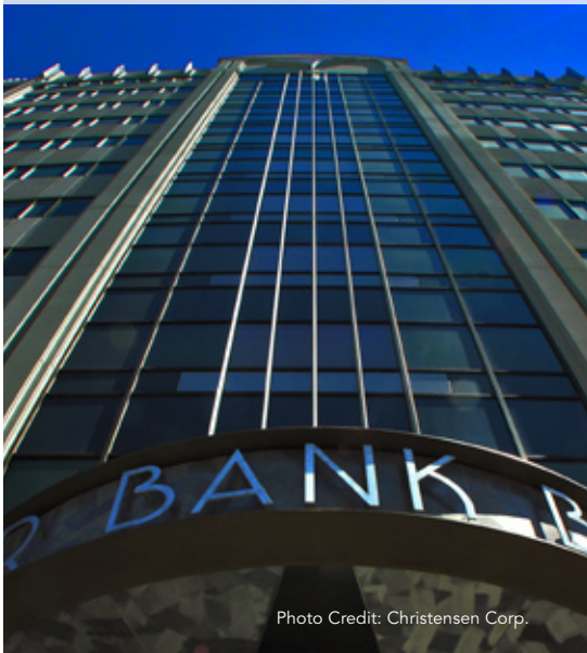
Banner Bank Exterior

Energy efficient strategies of Banner Bank provide additional benefits. The raised floor system that expedited data and power runs during construction, provides tenants with optimum outlet and supply air placement, and is also easy to reconfigure. Modular walls and clear span spaces in combination with the raised floor system minimizes owner churn costs and provides both the owner and tenants tremendous space flexibility.