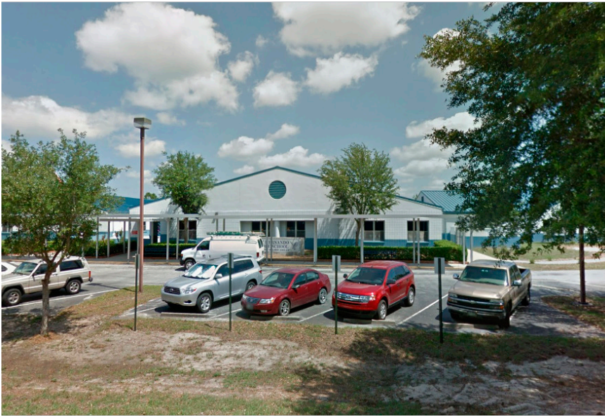
West Hernando Middle School felt effects of outdated HVAC technology chose Daikin for DOAS and VRV solutions that deliver comfort for occupants and a quick ROI for the school district.